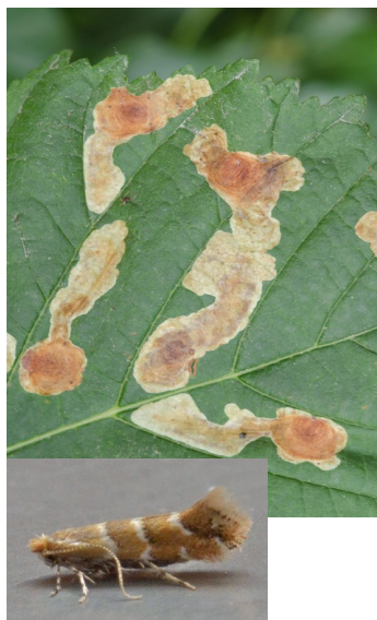
Horse Chestnut leaf with miner blotches (inset: moth)