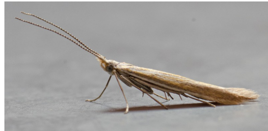
Family Coleophoridae ( Coleophora sp. ) Upright posture with long forward-pointing antennae The rather drab colouration makes it difficult to identify the individual species without dissection