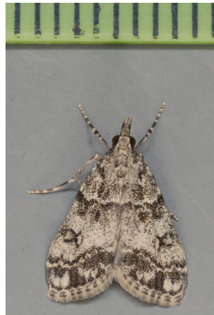
Eudonia lacustrata (from mid-May)