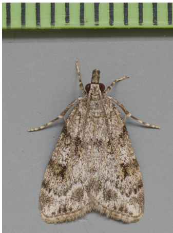
Scoparia ambigualis (from late April)

Illustrated below are three closely-related species from the genera Eudonia and Scoparia (also family Crambidae) that have overlapping but different flight times. Fresh specimens of these species can be distinguished with care on wing patterns but timing can also be useful.