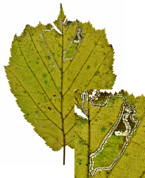
Stigmella microtheriella mine in Hazel leaf (inset: close-up of end)