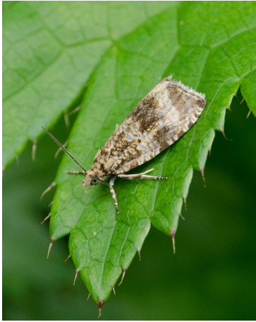
Celypha lacunana commonly seen in gardens

While you are likely to encounter micro-moths in light traps, only a small fraction are regularly found there. However, you may find them flying in daylight in gardens and the countryside (or found at night with a torch).