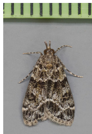
Eudonia mercurella (from June)