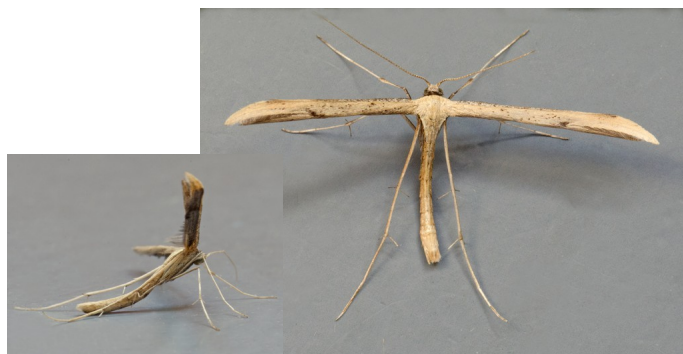
Family Pterophoridae ( Emmelina monodactyla ) These are the Plume Moths, recognized by their T-shape