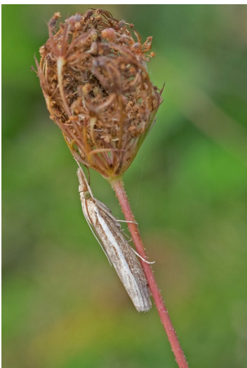
A grass moth ( Agriphila tristella )

Also, in grassy places, small pale moths are frequently disturbed by day, flying short distances and 'disappearing' by aligning against grass stems – these are the grass moths (example below). Further, a substantial number of micro-moths can most easily be identified by examining plants for traces of their larval stage. These may be seen as distortions of leaves (folding or 'spinning') or as 'mines' where the larva burrows under the leaf surface to form characteristic tunnels or blisters. The most obvious of these 'miners' at present is seen on many Horse Chestnut trees, where the leaves progressively show unsightly brownish blotches in late summer caused by the larva of a tiny (3.5-5 mm) moth, Cameraria ohridella (see below). A number of micro-moths specialize in the plant species they mine and these have characteristic features that help identify the moth (an example on Hazel below). Other micro-moths may be recognized by the cases that they build on foliage or tree trunks from a variety of materials to protect themselves from predation (e.g., moths from the families Adelidae, Psychidae, Coleophoridae), and yet others feed inside the stems of plants.