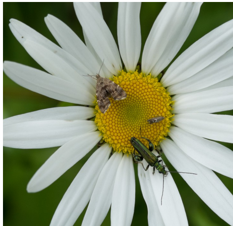
Anthophila fabriciana (Nettle-tap, top left) with Glyphipterix sp. (mid right) and green beetle on Ox-eye Daisy.