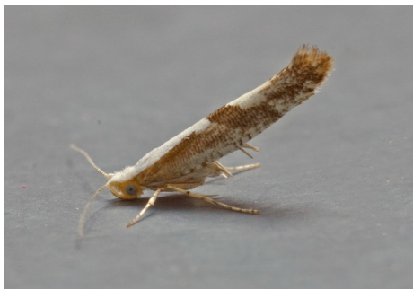
Family Argyresthiidae ( Argyresthia pruniella ) Declining posture with head close to the surface