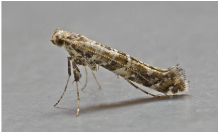
Family Gracillariidae ( Gracillaria syringella ) Most have upright posture with long tufted front legs, some with strikingly patterned wings, as seen here

In some families the wing shape varies (e.g. the Crambidae family, seen above with triangular or even butterfly-like shapes, also includes the grass moths), but in those families illustrated below most species have a relatively uniform shape and/or posture that helps identify them.